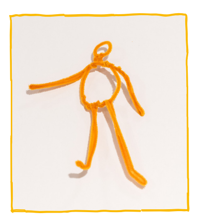
Bend, fold & twist

Use pipe cleaners to create the outline of your figure.