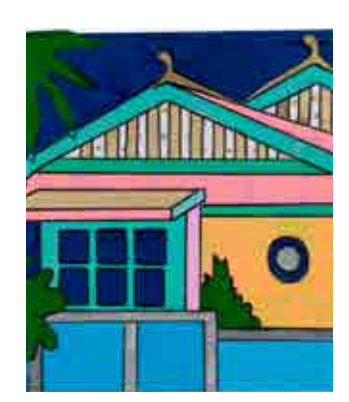
Created by students at an NGV workshop