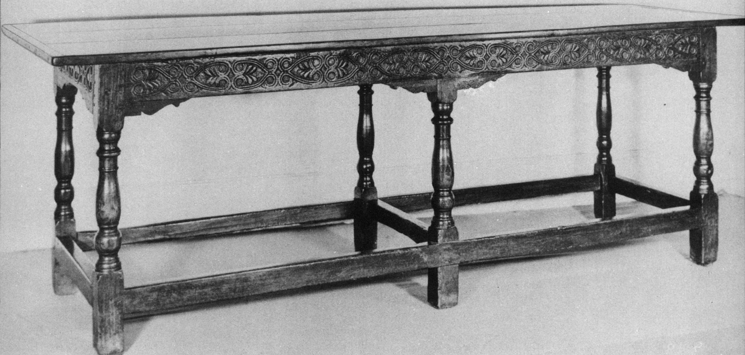
OAK REFECTORY TABLE, English . Height 2 ft. 7 in., Length 8 ft. 3 in., Width 2 ft. 6 in.