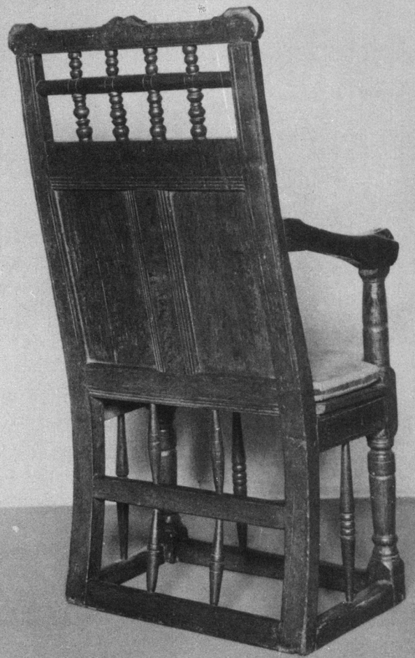
OAK CHAIR, English . Height 3 ft. 11 in., Width 23 in.